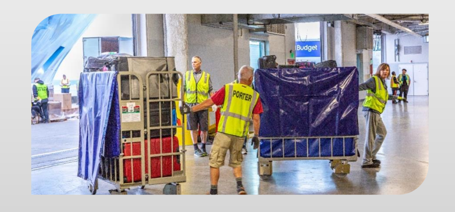
5,500 total jobs